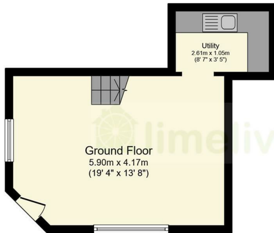
Ground Floor Floor area 28.6 sq.m. (308 sq.ft.)